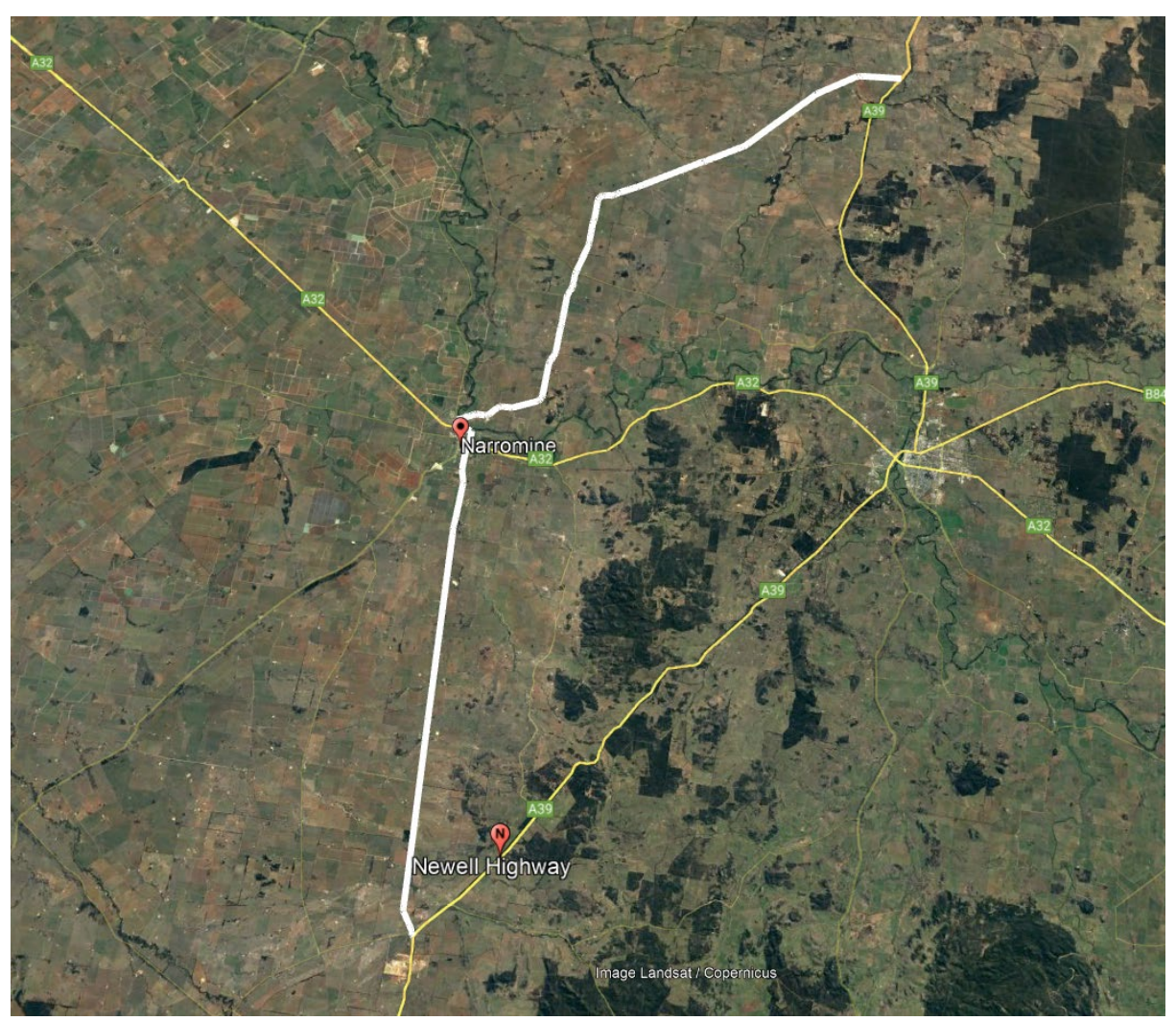
Figure 1: Proposed Road to be Transferred. (Tomingley – Eumungerie Road)

Following a Government commitment announced in February 2019 for a process to transfer up to 15,000 kilometres of Council-owned roads back to the State, Tomingley-Eumungerie Road was nominated out of 210 applications. TfNSW as an owner of the road would like Narromine Shire Council to carry out maintenance work under Road Maintenance Council Contracts (RMCC).